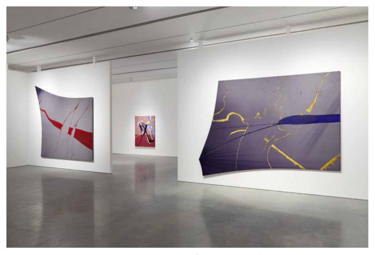
Installation view, Julian Schnabel: The Patch of Blue the Prisoner Calls the Sky , 2020, Pace Gallery, New York © Julian Schnabel